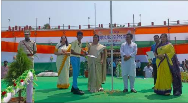
Students receiving prize for their excellency in debate and song competition in the district level