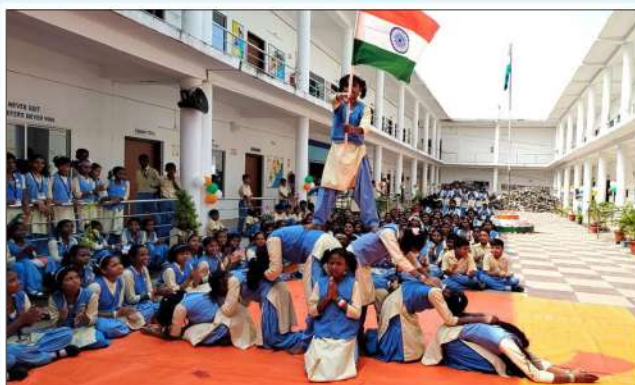
77th Independence day Celebration at OAV- Jamudiha