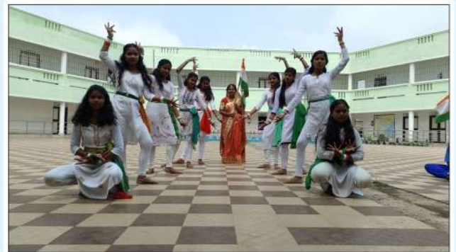
Cultural program on Independence day, OAV- Tingiria, Raruan, Mayurbhanj