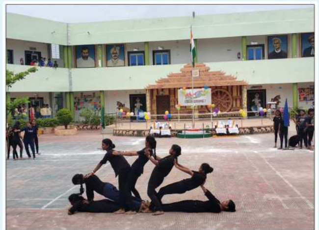
Program on Independence day, OAV Badapur, Patrapur, Ganjam