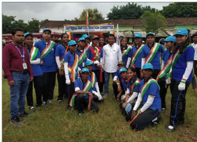
Got 1st Position in Senior Parade Troop on the eve of 77th Independence Day Celebration OAV -CHANCHARAPADA , JAIPATNA , KALAHANDI