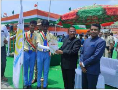
OAV Begana, Korei, Jajpur (2nd Position in District Level Senior Parade on Independence Day)