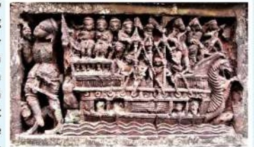
Boat on the wall of Raghunath Temple, West Bengal narrating maritime heritage

Our ancestors had excellent knowledge of sea roots, winds and other aspects of navigation. We should feel proud of our maritime history. Today also the maritime sector is playing an important role in protection and prosperity of our nation.