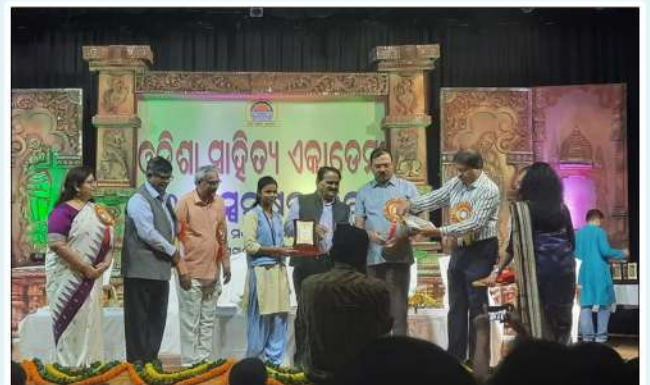
2nd Position at Odisha Sahitya Academy, Bhubaneswar on Elocution of OAV- Salapada, Anandapur, Keonjhar