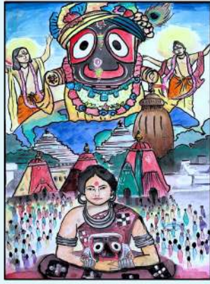
KAILASH MANDAL, CLASS-IX OAV- CHHELIGADA, GAJAPATI