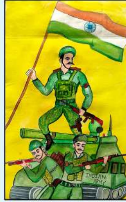
AMIT BHOI, CLASS-VI OAV-SANKARPUR, BIRIDI, JAGATSINGHPUR