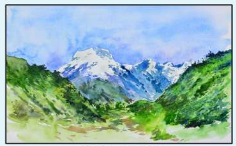
SIBASISH DAS, CLASS-IX OAV-TARANDO, KENDRAPARA